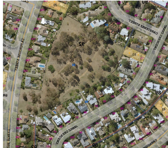
Images of Blaxland Park (left), where tree planting is a priority and Griffith Woodland (right), which is being re-generated. (images are at different scales)