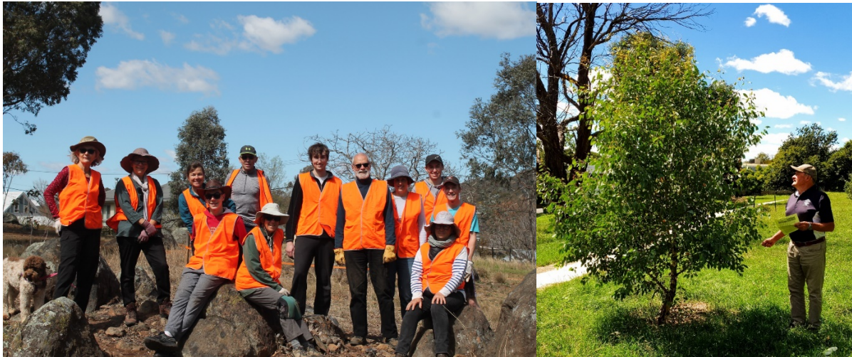
The Griffith Woodlanders taking a break from planting, weeding and caring for the habitat.

Last summer the ACT government installed over 600m of paths and a water tank for the inevitable drought to come. The park is now much more accessible. Future plans for the park include a small native garden and continual maintenance to maintain the health of the trees. To join the Friends of Blaxland contact Mac Howell at machowell@homemail.com.au