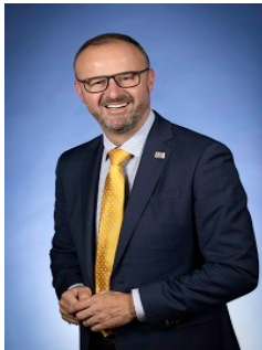
Andrew Barr ALP